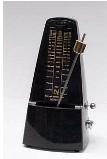
A metronome: provides a rhythmic cadence, a characteristic rhythmic pattern.

Bunnings is back. Pub raffles are back. Feed Me and Bellbrae Cemetery work is ongoing. We are meeting at the Village, the second and fourth Thursday of each month. As regular as clockwork.