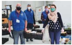
Torquay Lions deliver meals for Feed Me Surfcoast.

One hundred per cent of all funds donated by the