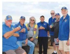
Torquay Lions relax after cleaning the foreshore on New Year's Day.

"From virtual meetings and fundraising, to new