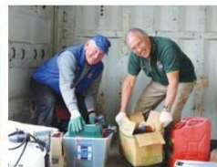
Anglessa and Torquay Lions load much-needed tools for fire devastated districts.

More than $5 million is invested in youth